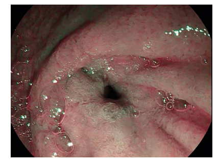
i-scan OE increases contrast and visualizes vascular patterns